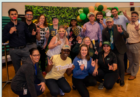
Employees from the ASBC attending the event gathered to take a photo together in front of the "photo booth" backdrop.

Three sessions of the appreciation event were held, one for each shift. Attendees had the opportunity to kick back, take a break from their usual work day, and enjoy a fun atmosphere. The two hour long events provided delicious food, snacks, desserts