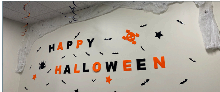
Spider Webs covered the Business Center breakroom

OAS got into the Halloween spirit this year with a decorating contest. Four areas participated in this year's decorating contest: Parking and Transportation Services, the Business Center, the Post Office, and Building Services. Each area was invited to show their spirit by decorating an area of their space. On October 29, two student judges visited each area that participated in the contest, and delivered a trophy to the winning area: the Post Office! Thank you to everyone who participated in the contest, we're thrilled to show off the decorations here.