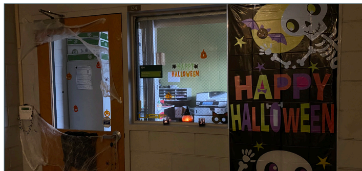
Decorations by Building Services. (Spooky music emanating from the office not pictured.)