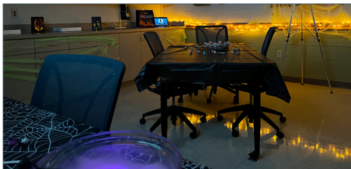
Pictured above: The Post Office breakroom, complete with lights, fog, spider webs, and candy at every table.